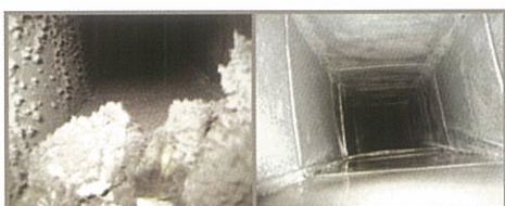
Air Supply Duct